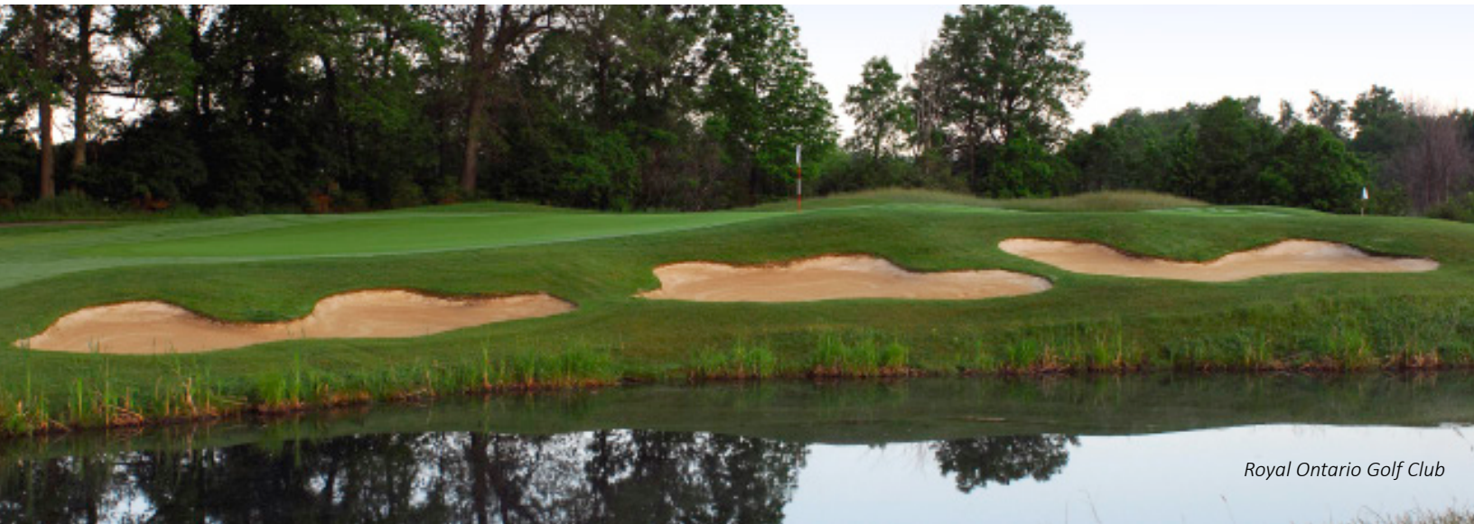
Royal Ontario Golf Club