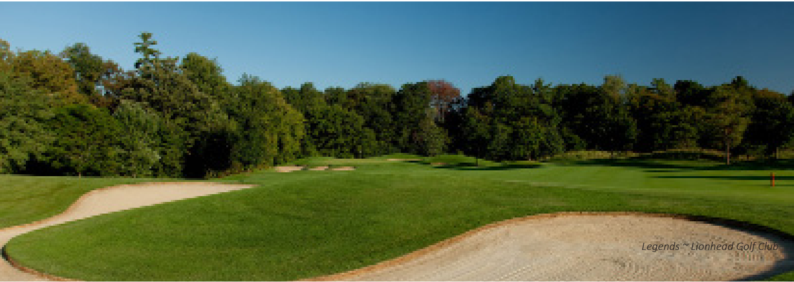
Legends ~ Lionhead Golf Club